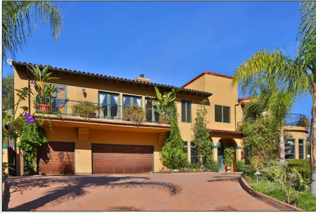
Tuscan Mediterranean, Bell Canyon $2,150,000 6 BD, 6½ BA, gourmet kitchen, office with built-ins, master with fireplace, sitting room, spa tub. Crown moldings, wood ceilings, travertine floors, decks. Pool & spa, BBQ center, fruit & shade trees, basketball court.