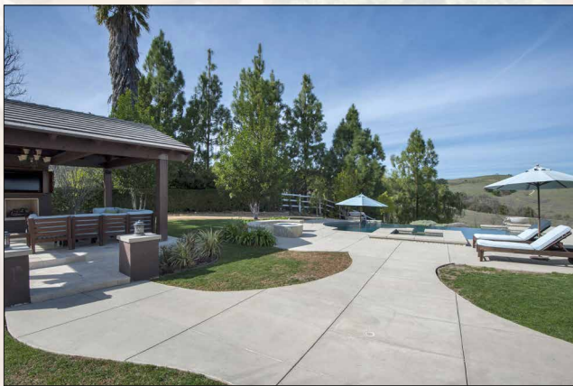
Beautifully Remodeled, Hidden Hills $3,250,000 Pastoral views. 6 BD, 6 BA, chef's kitchen with Viking & Sub-Zero appliances. Living room with volume ceilings, walls of glass. Master suite with fireplace, dual walk-in closets. Pool, spa. Sports court. Barn, arena.