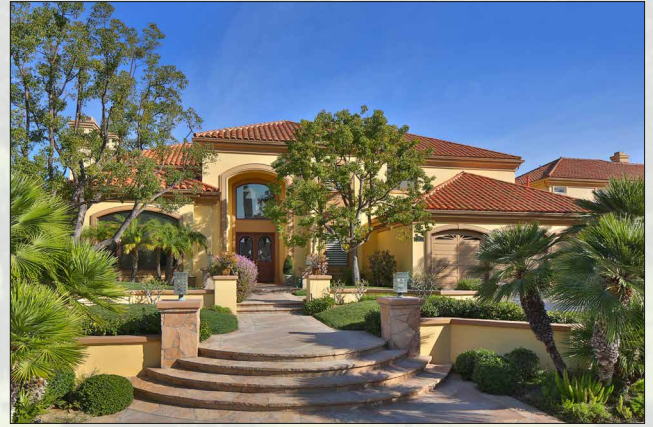
Mountain View Estates, Calabasas $2,185,000 6 BD, 7½ BA, grand entry, marble floors, custom chandelier. Eat-in kitchen, family room with wet bar, entertainment center. Master with dual baths & closets, walk-out balcony. Sweeping views, pool, spa, 3-car garages.