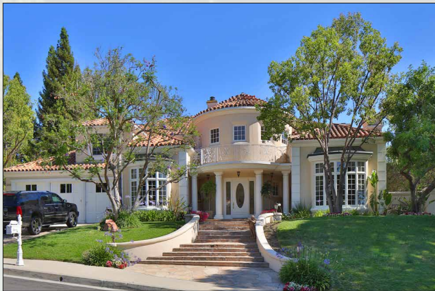
Mountain View Estates, Calabasas $2,495,000 Plan 10, private flat lot. 6 BD, 6½ BA, office, formal dining, paneled family room, large master with sitting room, dual walk-in closets. Newly plastered pool & spa, BBQ center, large sport court, lawns, mature trees.