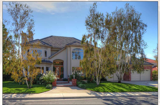
Mountain View Estates, Calabasas $1,875,000 Immaculate on a big corner lot, 6 BD, 5 BA. Gourmet kitchen open to family room, three fireplaces, large master with sitting room, 4 car garage with 2 lifts, lushly landscaped, pool, spa, grass, fruit trees.